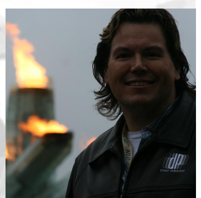
Donny Parenteau