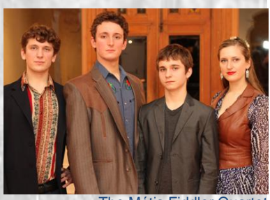
The Métis Fiddler Quartet

The Trades Council paper is available at http://www.saskbuildingtrades.c om/wpcontent/uploads/2012/06/tradestraining.pdf